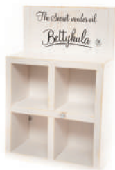
SMALL 32W X 50H X 16D CM

Handcrafted quality timber units. Making your display even more eye-catching, keeping valuable selling space to a minimum, and your buying decision even simpler!