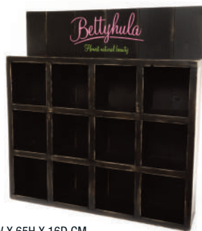
LARGE 62W X 65H X 16D CM